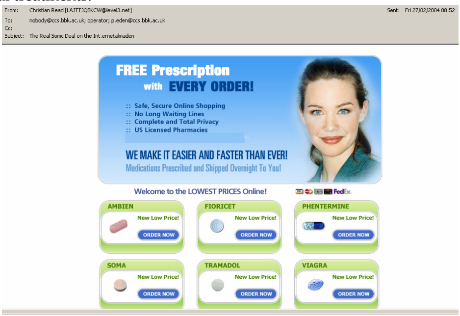
Figure 5: Health related spam.

Health: health-related products and services and including pharmaceuticals and medical treatments.