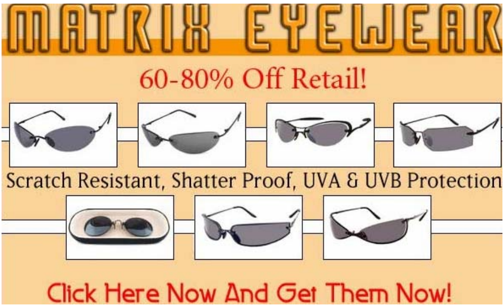
Figure 3: Spam advertising a product.

Products: offering or advertising commercial goods and services.