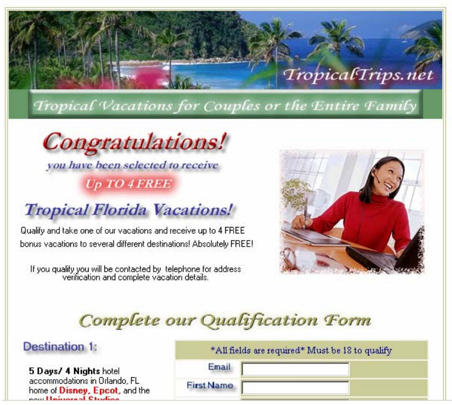
Figure 4: Commercial spam: Selling vacations.

Health: health-related products and services and including pharmaceuticals and medical treatments.